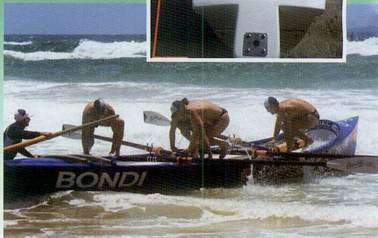
Above: Bondi crew jumping in the boat at the start of a race.